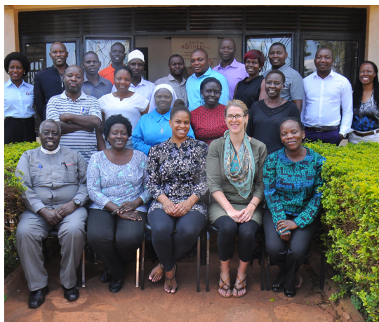
Photo moment: International class joined by STM faculty and STM Canada staff.