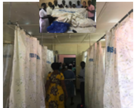
Curtains for Kagando maternity ward. Inset(STM team hands over the curtains to Kagando hosptial staff.

Dignified and respectful maternity care is one of the pillars of the MBFHI.