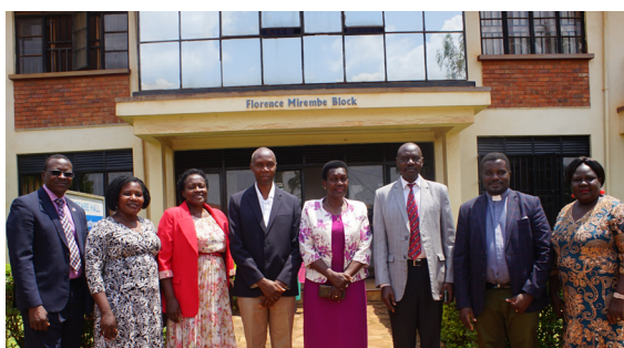
STMEA and UCU leadership team