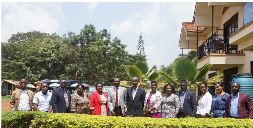
Picture moment after the handover ceremony.