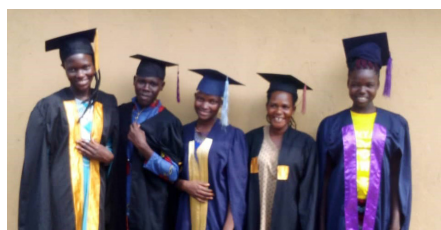
G r a d u a t e s