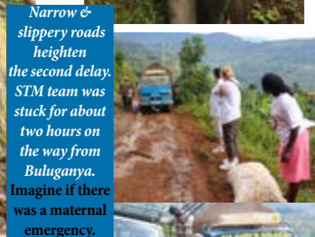
Narrow & slippery roads heighten the second delay. STM team was stuck for about two hours on the way from Buluganya. Imagine if there was a maternal emergency.