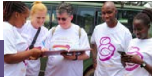
See story on page 2 & 3