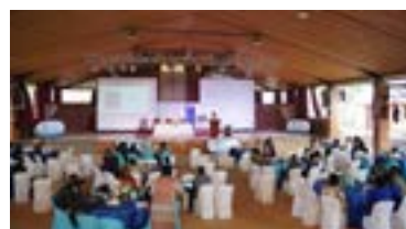
Cross-section of delegates