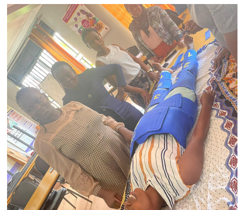
NASG use demonstration