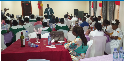
The RDC addresses safe motherhood stakeholders