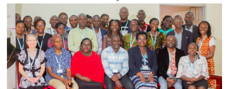
Game changers at STMEA dialogue on 28 Nov at Uganda Christian University, Mukono

For more news on the STM dialogue, look out for our next issue.