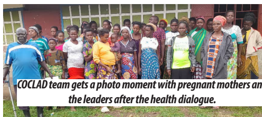
COCLAD team gets a photo moment with pregnant mothers and the leaders after the health dialogue.