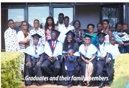
Graduates and their family members