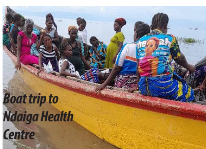
Boat trip to Ndaiga Health Centre

A few days after the health education, Ndaiga health facility received 58 pregnant mothers for the first time after 15 years and of these 45 received ANC. COCLAD will support the completion of the ANC visits.