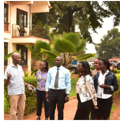
A tour around Mirembe Hall