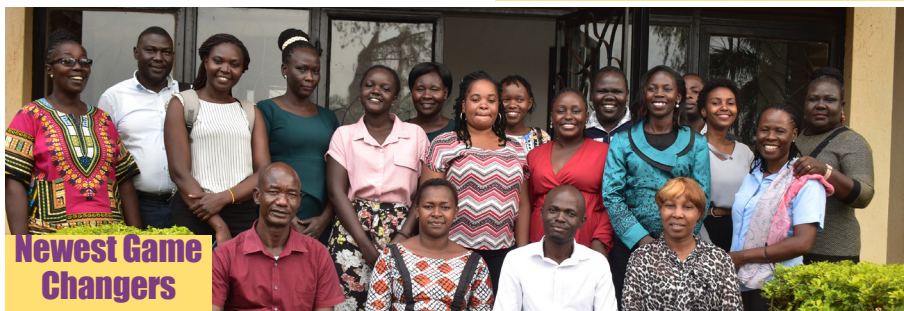
Newest Game Changers

Save the Mothers was honoured to receive the Master of Public Health Leadership (MPHL) class 2024, January intake for orientation at Uganda Christian University. The orientation was conducted on 29 Jan to 2 Feb. During the orientation week the students also attended lectures on site.