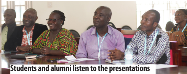
Students and alumni listen to the presentations

She noted that the maternal mortality ratio in Uganda had dropped from 336 maternal deaths/100,000 live births to 189/100,000 which is a significant step towards the goal of 70/100,000.