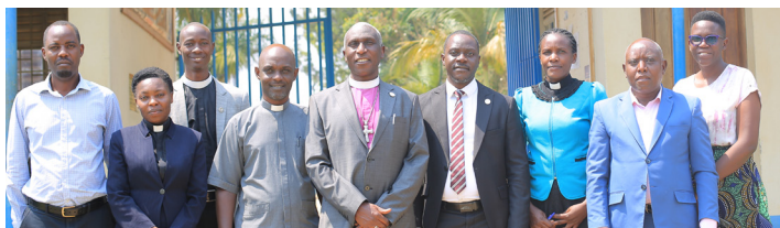
UCU-STM team joins the Bishop and his team for a group photo.

Save the Mothers is honored to collaborate with faith leaders in advancing maternal and child health within their communities.