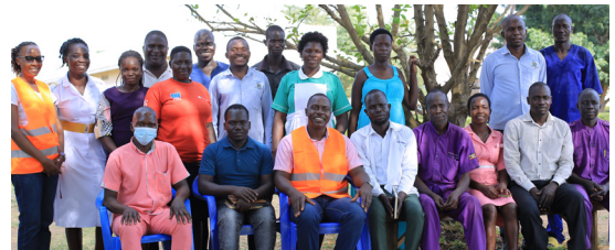
A group photo celebrating the STM-Amai Community Hospital partnership.