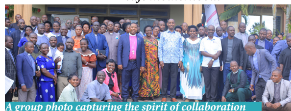
A group photo capturing the spirit of collaboration