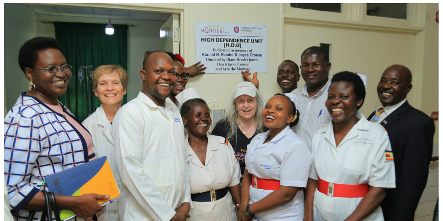
Tororo Hospital team, district officials and STM team at the Tororo Hospital Maternity HDU launch