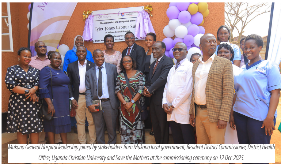
Mukono General Hospital leadership joined by stakeholders from Mukono local government, Resident District Commissioner, District Health Office, Uganda Christian University and Save the Mothers at the commissioning ceremony on 12 Dec 2025.

At the ceremony were Mukono General Hospital leadership, stakeholders from Mukono local government, Resident District Commissioner, District Health Office, Uganda Christian University and Save the Mothers. To page 2