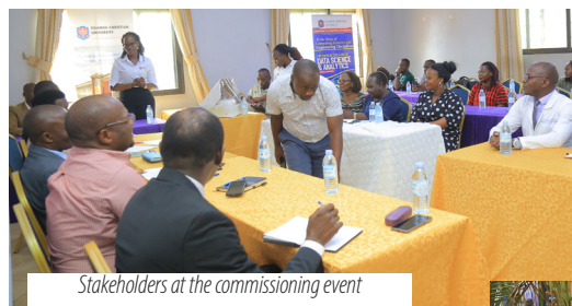
Stakeholders at the commissioning event